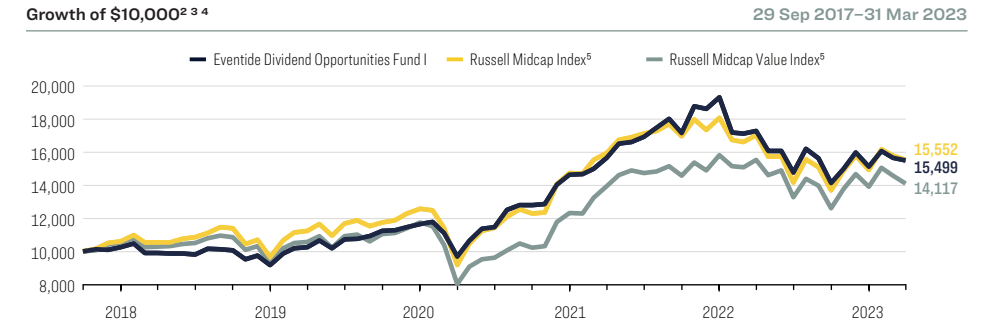
This is a hypothetical illustration and is not intended to reflect the actual performance of any particular account. Future performance cannot be guaranteed and investment returns will fluctuate with market conditions.

The Eventide Dividend Opportunities Fund is a diversified mutual fund seeking to provide dividend income and long-term capital appreciation with the added objective of dividend growth. The Fund seeks to achieve its objectives by normally investing at least 80% of net assets in high-quality, dividend-paying companies. The Fund invests in securities of companies that we believe demonstrate values and business practices that are ethical, sustainable, and provide an attractive investment opportunity.